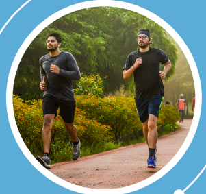
Quality Health Care